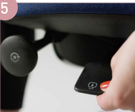
UNLOCK THE DYNAMIC TILT